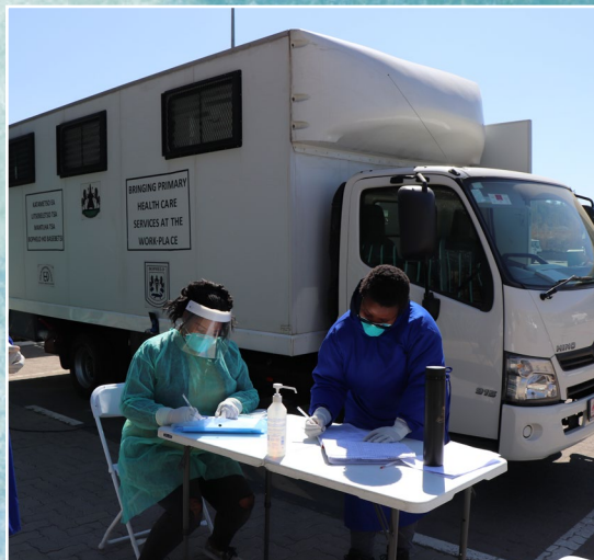
Top Left Photo: Muzi Yende/EGPAF, 2020, Top Right Photo: Anthony Kushaba/EGPAF, 2020