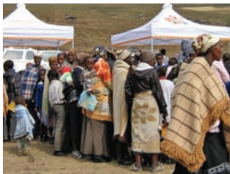
Local residents queue up for HIV testing and counseling during a Child Health Day At Mokhotlong.

Lesotho's National HIV and AIDS Strategic Plan (2006–2011) provides a framework for a coordinated and strategic national HIV and AIDS response, with the aim of halting the epidemic through provision of comprehensive HIV care and support. The plan sets a target for the government of Lesotho to reduce new HIV infections among children by 50% and to provide HIV services to all HIV-positive children and their families by 2011. 2