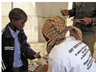
A lay counselor administers an HIV test during a Child Health Day in Botha Bothe.

Bothe) and Touching Tiny Lives (Mokhotlong)—coordinate the activities. Children with unknown HIV status, children who are HIV-exposed, and HIV-positive children are identified through screening of their child health booklets during immunization, the first service delivery stop of the day (the bukana [booklet] contains an immunization record, vitamin A supplement record, and growth chart). Children who test positive for HIV are referred to care and treatment through community and health facility linkages. Facility focal people and the Foundation-supported community coordinators are responsible for follow-up of HIV-positive children to ensure enrollment in treatment services.