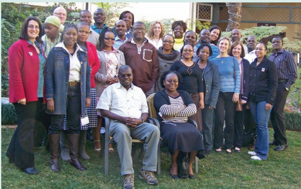
Participants of the August OR workshop held in Johannesburg, South Africa.