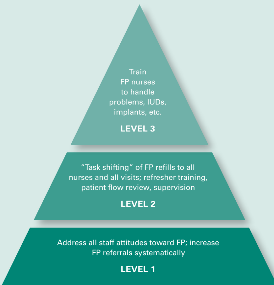
Figure 1. Health center family planning (FP) / HIV model