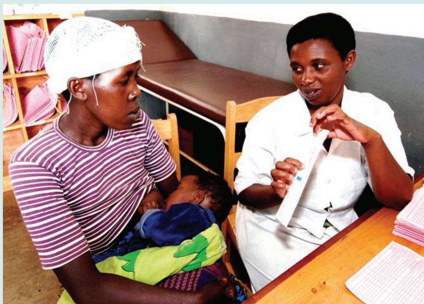
A mother of four receives family planning counseling after expressing her desire to begin using contraceptives.

See page 19 of the Country Program Notes section to read more about how the Foundation is supporting integration of HIV services into MCH settings in Rwanda.